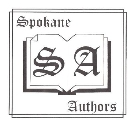
Page revised 05/02/2025 dam ©2021 www.spokaneauthors.org

reach the Oregon territories. Along the way, one boy's tale is interrupted by a ghost on a mission. I stumbled across this book at a craft fair and never regretted choosing it. The novel is short, but the story is fully fleshed out and engrossing. Enjoyable read. Recommended.